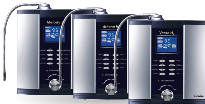
Melody II 5 Plates