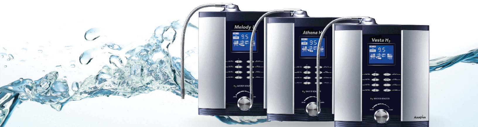
Melody II 5 Plates